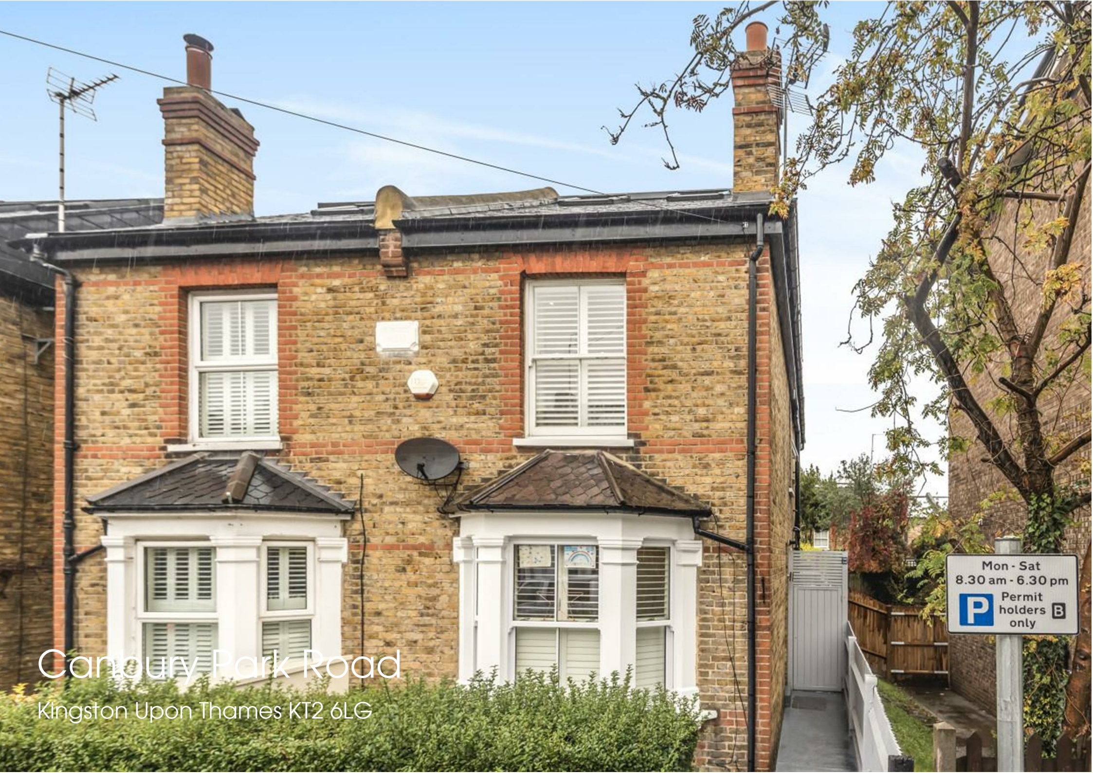
Canbury Park Road Kingston Upon Thames KT2 6LG